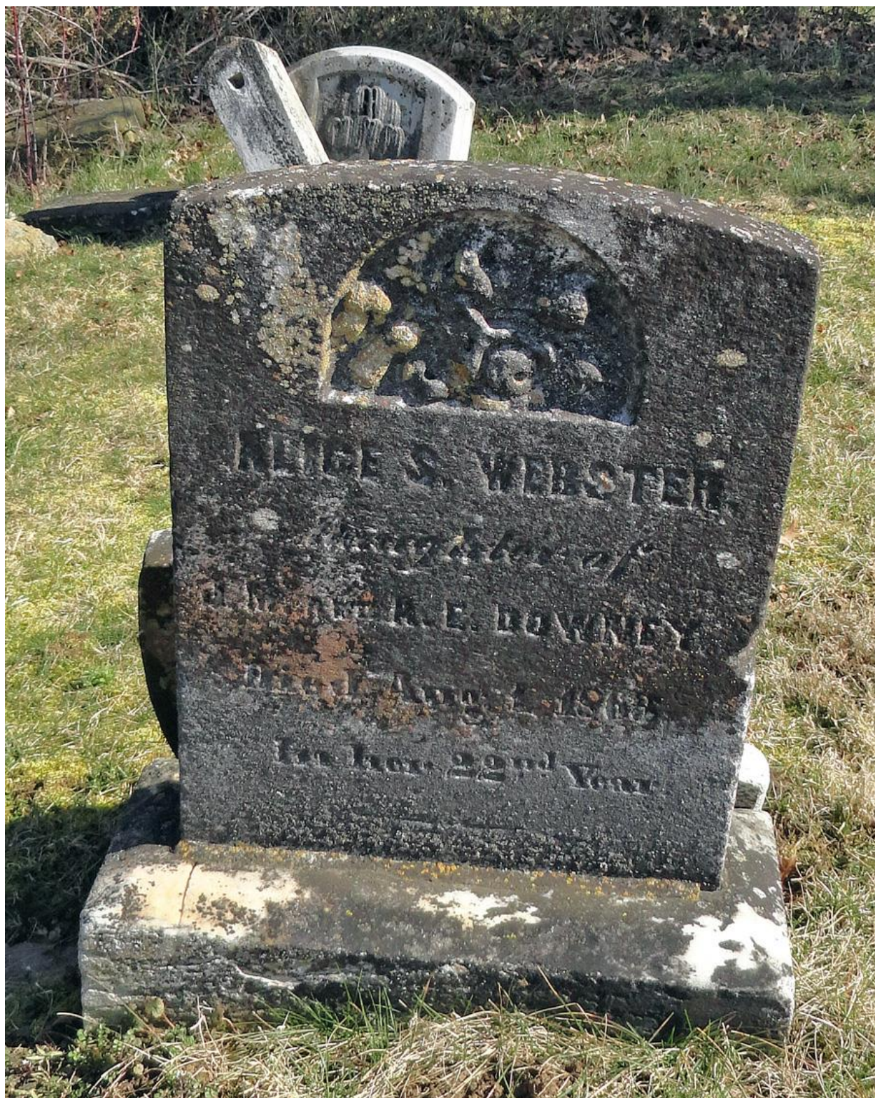
Grave marker for Alice Downey Webster.